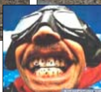
Buggy Sez... Lets Fly!