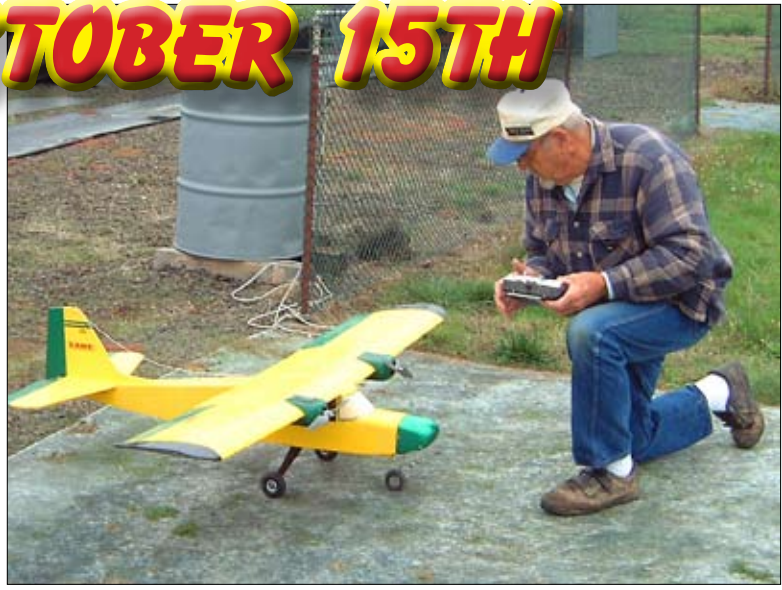
Another of Larry Baker's electric twin engine models. This one is powered with brushed, geared, "can" motors. It has a unique sound in the air. Saturday Oct. 15 was overcast and misty but three of us got in some good flights.